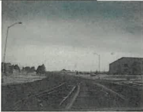
Near Normal/Mostly Clear