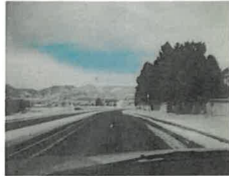
Near Normal/Mostly Clear