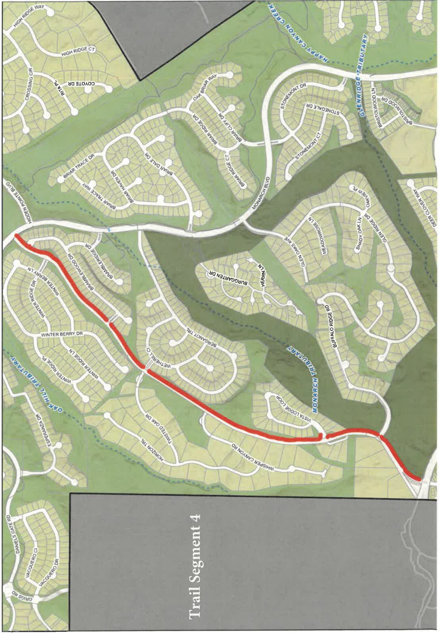
Trail Segment 4