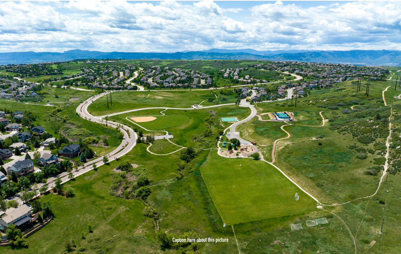
Caption here about this picture