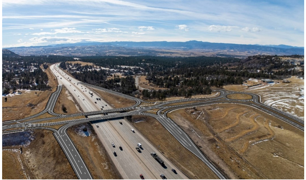
Rendering of a diverging diamond interchange at Happy Canyon Road and Interstate 25.

The preferred alternative shown to the INSERT DIRECTION, referred to as a Diverging Diamond Interchange (DDI), is being evaluated by a joint effort between the City of Castle Pines, Douglas County, the Colorado Department of Transportation, and the Federal Highways Administration. A DDI is a relatively newer interchange design that has been used across the country and more recently here in Colorado. Several of these interchanges were built along the I-25 corridor. Final design approval is expected this year with construction beginning in 2026 or 2027. Learn more about the project at CastlePinesCO.gov/HCInterchange .