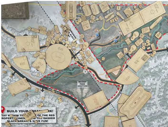
Conceptual plan of the proposed improvements to Coyote Ridge Park.