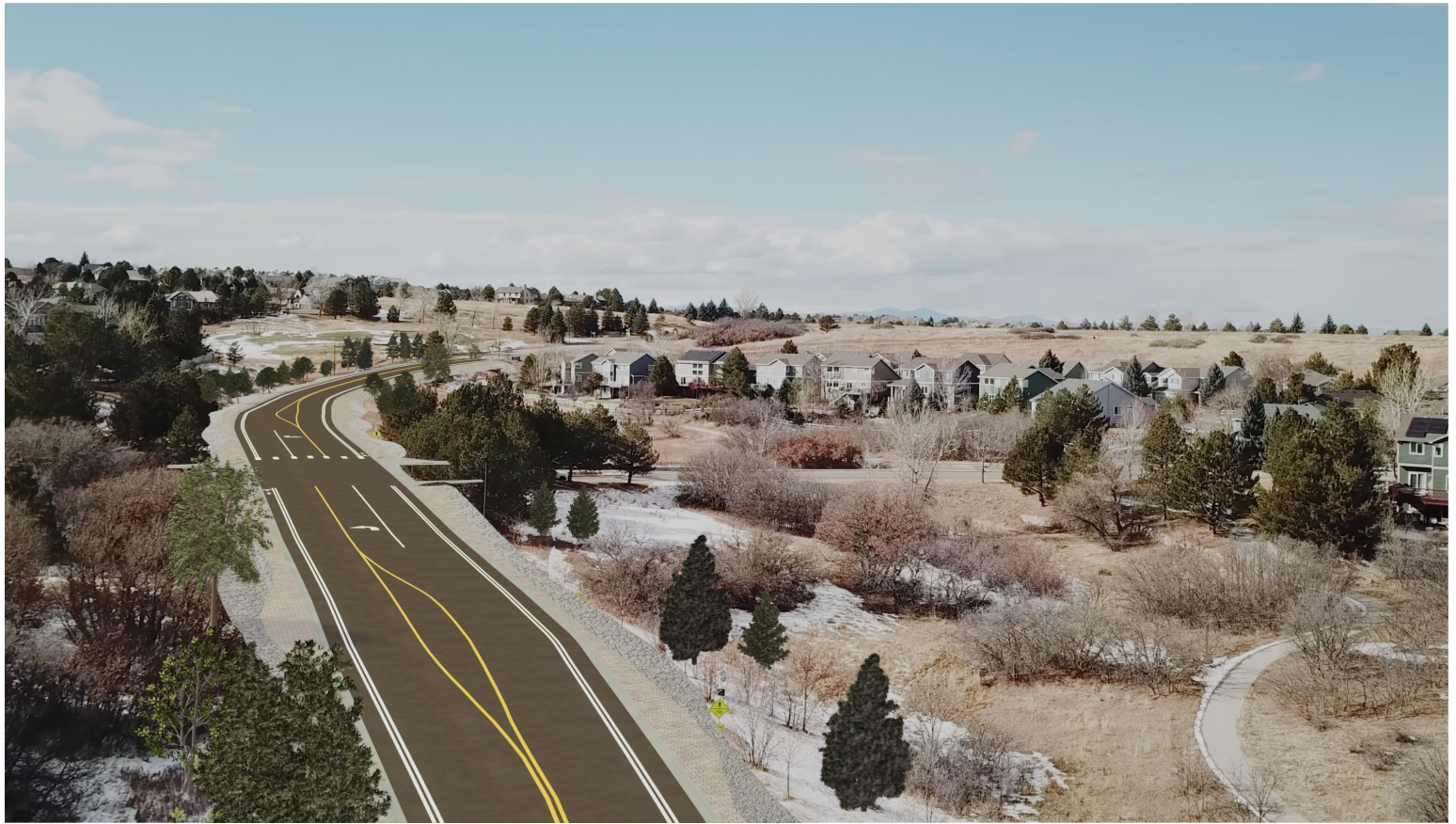
Aerial rendering of Monarch Boulevard.