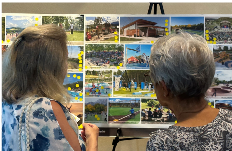
Public input was gathered at numerous public outreach events in 2023 and 2024